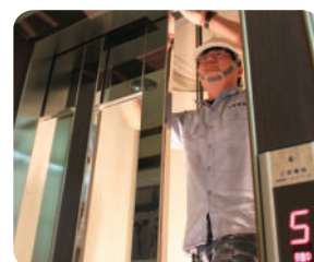
Maintenance / Repair / Modernization